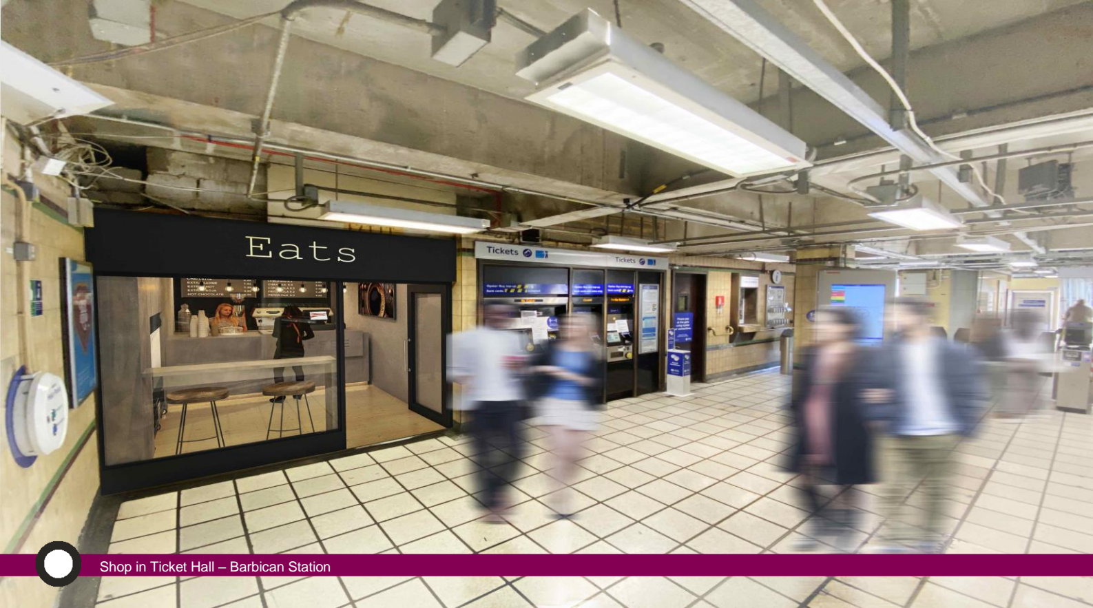
Shop in Ticket Hall – Barbican Station